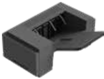
Output Expander MJ-5019