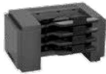
4-bin Mailbox MJ-5017