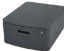
Swivel Cabinet MH-3100