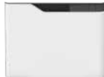
2,100-sheet High Capacity Feeder KD-1069