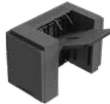
High-Capacity Output Expander MJ-5018