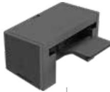
Staple Finisher MJ-1045